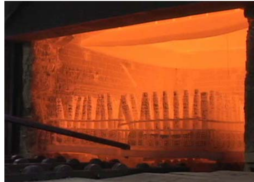
Forging heat treat furnace equipped with gas flow meter and camera to better control energy usage and ensure quality.